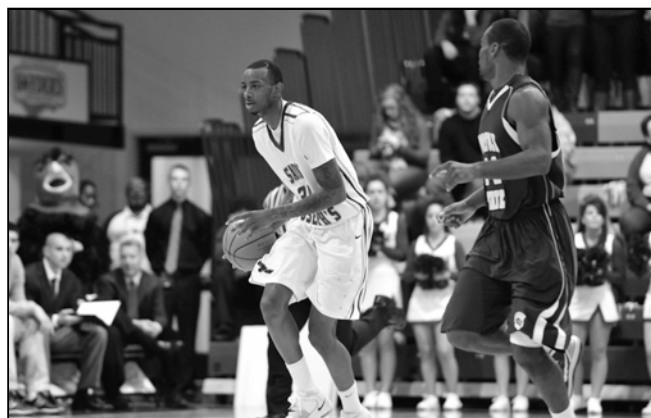
Saint Joseph's defeated Fairfield on the road, Norfolk State at home (pictured) and Rutgers at The Palestra to capture the Philly Hoop Group Classic.